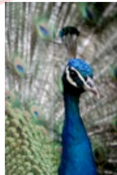
Birds and butterflies produce color without color pigments